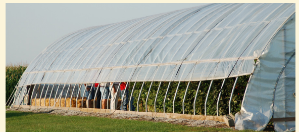
Photos (clockwise): Drip irrigation is used in this solar-heated greenhouse on Santa Cruz Farm in Española, N.M. String beans in Mississippi farmer Hattie Thompson's high tunnel. To adjust temperature, high tunnel covers can be raised so that air may flow in and out.

SPURRED BY ENTHUSIASM FOR FRESH, local agricultural products, farmers are increasing the availability of their crops beyond the traditional outdoor growing season. Premium prices and an extended income stream are some of the advantages farmers pursue with season extension techniques. Main strategies for creating extended-season sales include: growing in greenhouses, high tunnels (or “hoop houses”) or under temporary row covers; storing non-perishable crops for sale in the off season; or minimally processing crops.