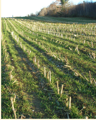
A cover crop grows in no-till corn residue on a Maine farm.