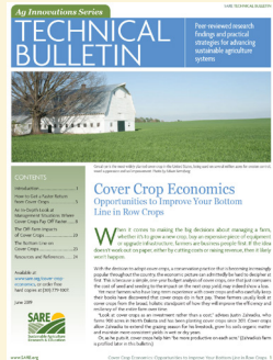
Cover Crop Economics www.SARE.org/cover-crop-economics