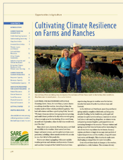
Cultivating Climate Resilience on Farms and Ranches www.SARE.org/climate-resilience